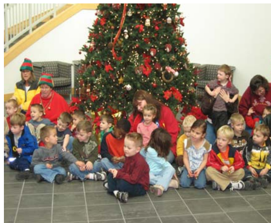
Oquirrh Hills Preschool at City Hall

Thank you Oquirrh Hills Preschool for sharing your delightful students and music with us at City Hall.